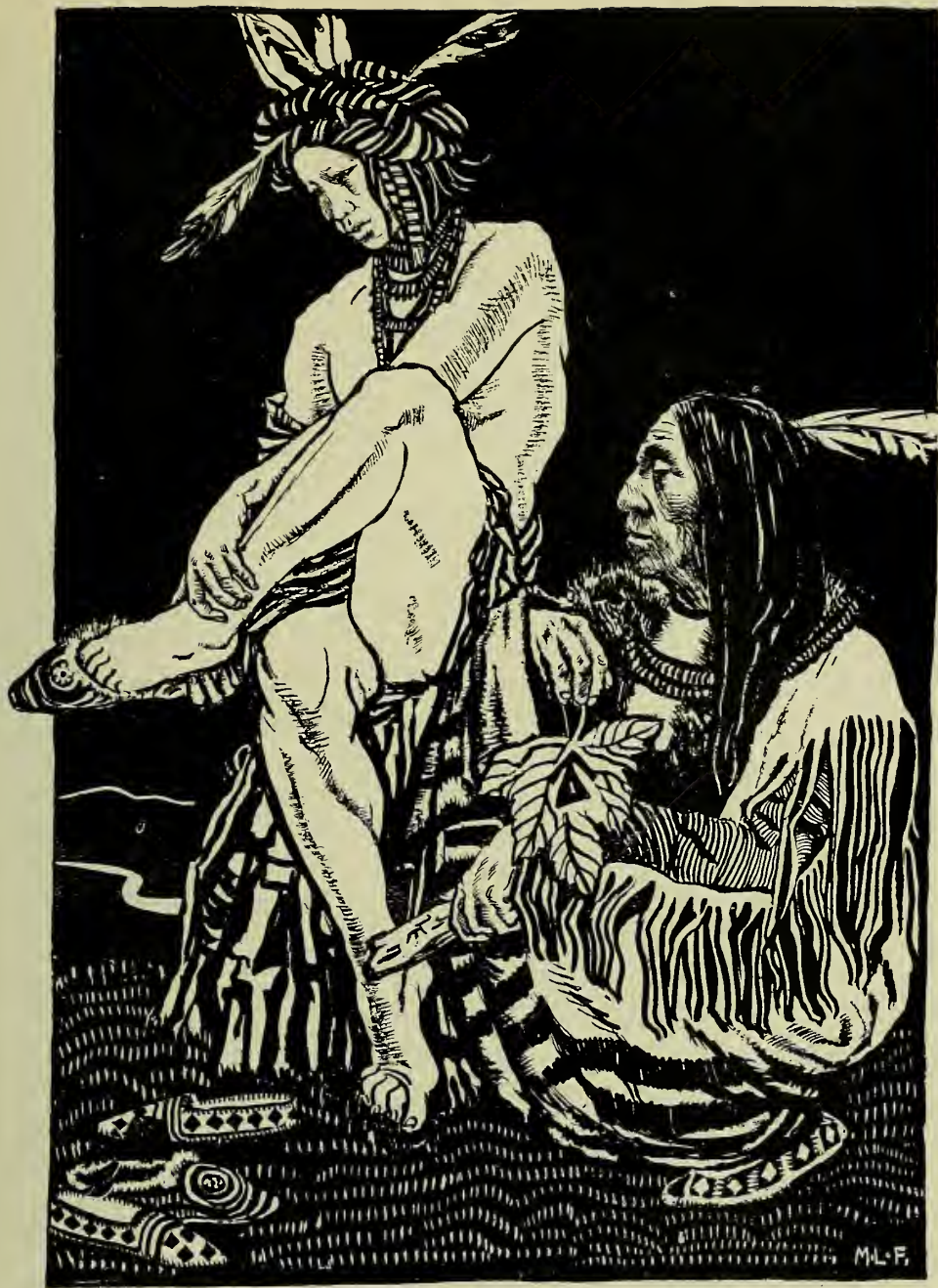
THE MAN GAVE HIM ANOTHER PAIR OF MOCCASINS IN EXCHANGE FOR THOSE HE WAS WEARING